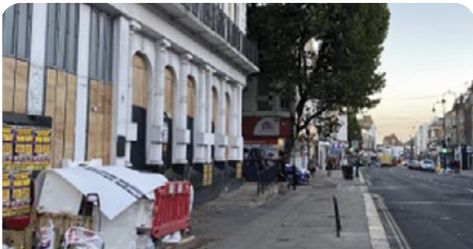
Warmer days - 30 August 2022.