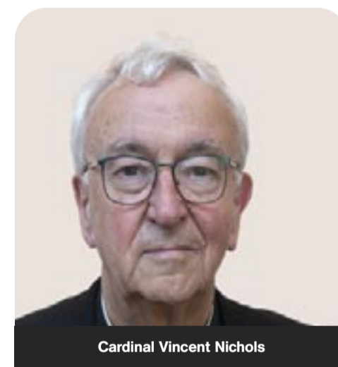
Cardinal Vincent Nichols

I trust that our parish communities will always be open to those suffering from hardship and in particular need of companionship and spiritual support at this time. They can help us to