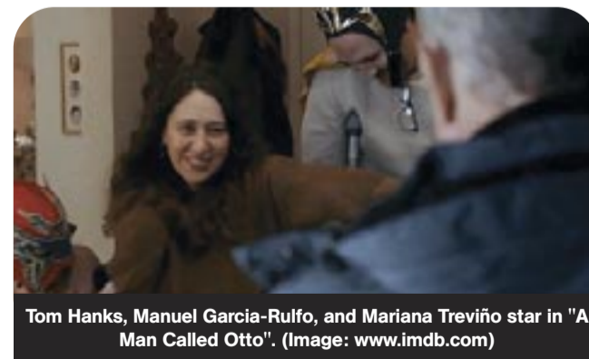
Tom Hanks, Manuel Garcia-Rulfo, and Mariana Treviño star in "A Man Called Otto".